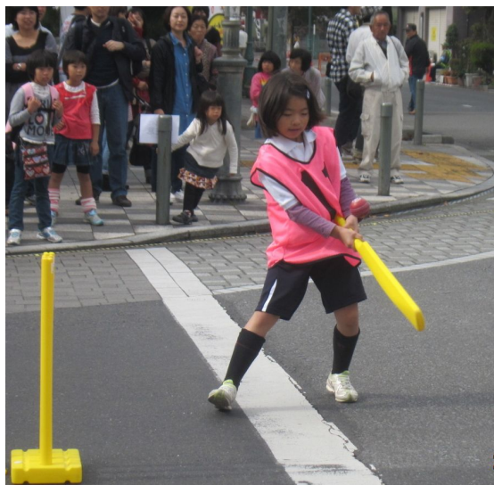
Japan cricket in a professional light.

As such, three levels of competitions guidelines have been created.